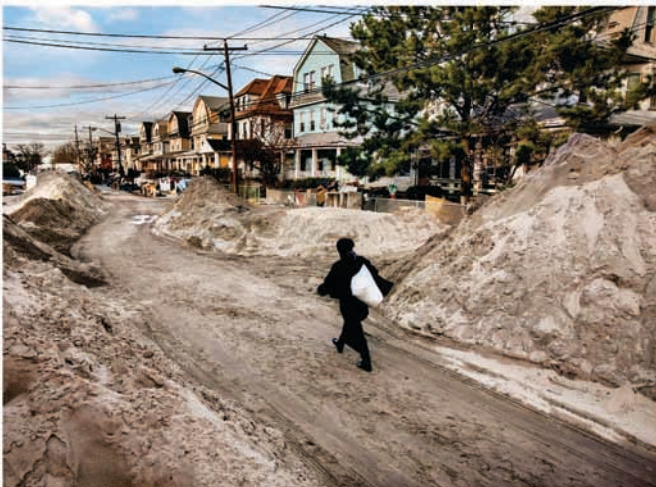
Beach 119th Street, Rockaway Park.