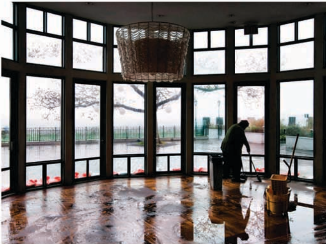
Battery Gardens restaurant, Manhattan, which took in ten feet of water.