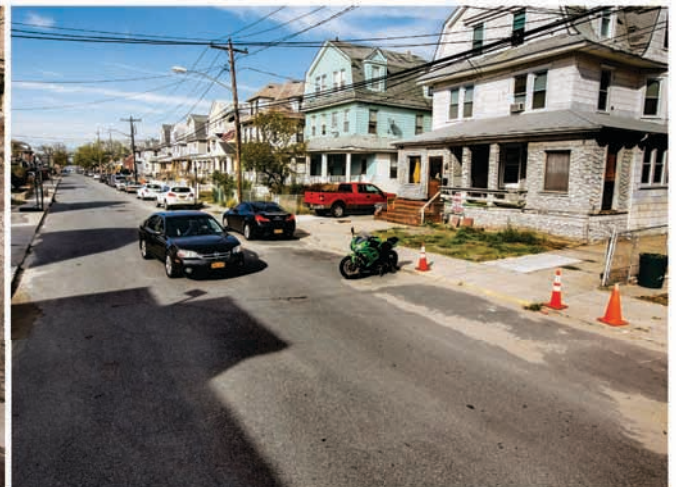
A year later, the street was almost back to normal.