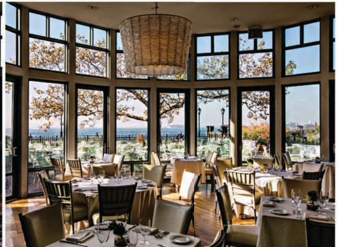
It hosted its first wedding since the storm on November 9, 2012.