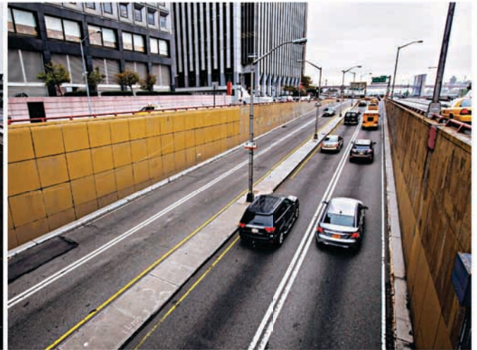
It was reopened by November 14, 2012.